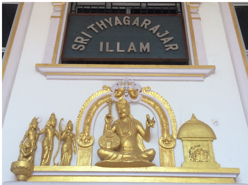
Entrance Sign at renovated Home of Saint Thyagaraja