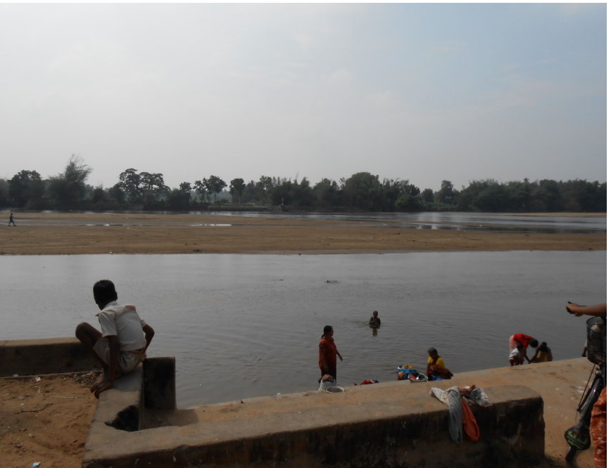
Samadhi on the banks of the Cauvery River