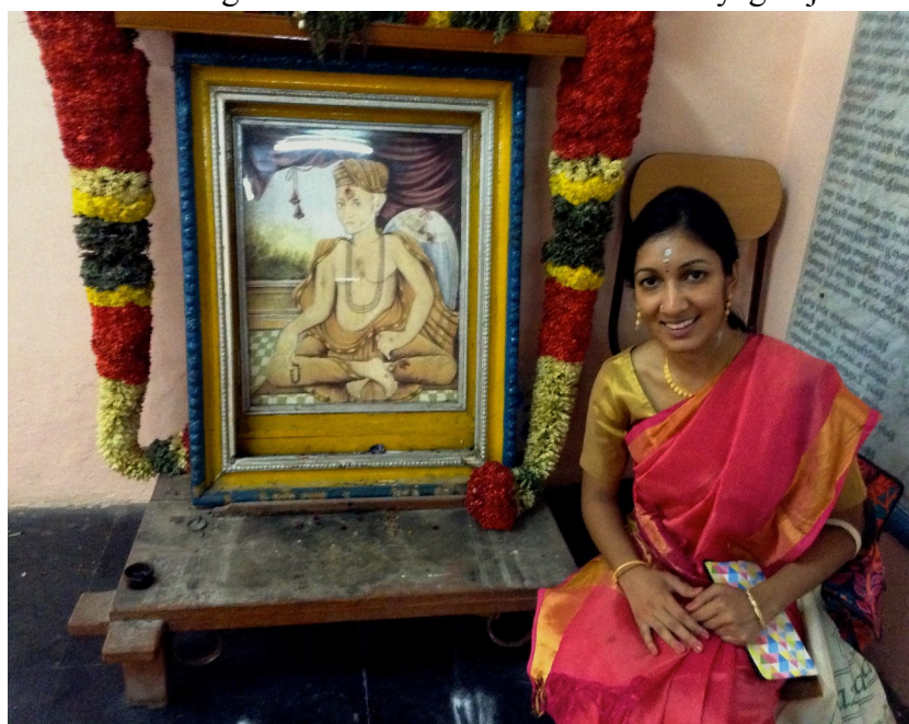
Saint Thyagaraja Temple — Oldest Painting