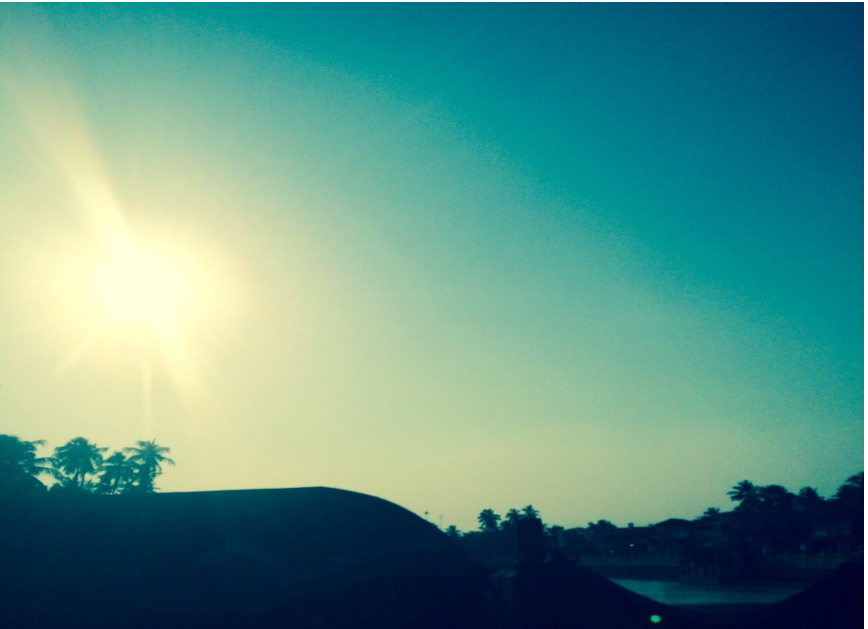
Early AM at Thiruvaiyaru